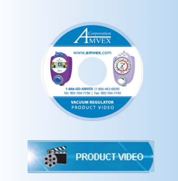
Visit WWW. amvex.com for the Vacuum Regulator product video and more!

Ask us or our distributor partners which type of vacuum regulator model best meets your patient population and needs.